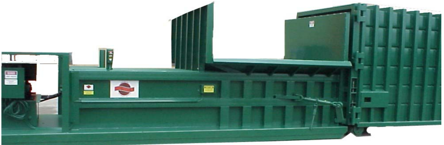
Shown with optional Remote Control Station