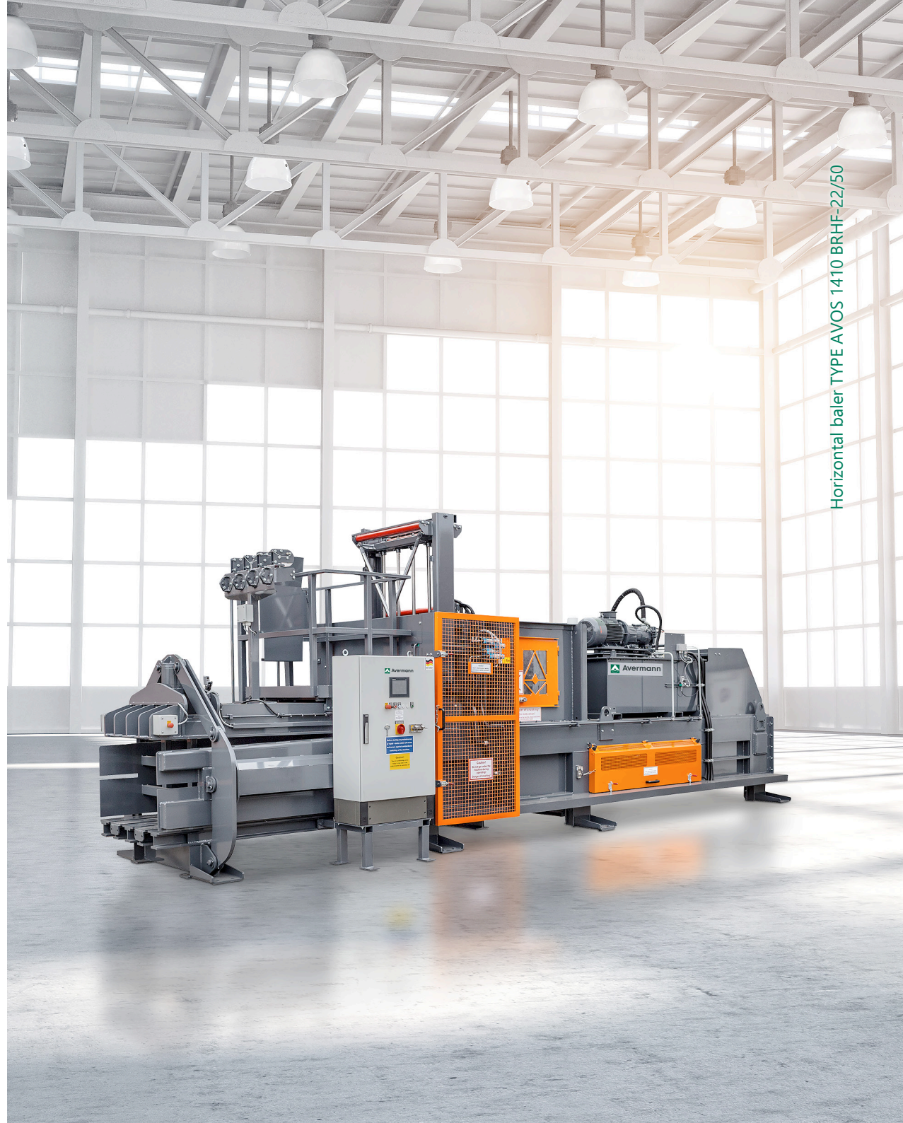
Horizontal baler TYPE AVOS 1410 BRHF-22/50

Phone +1-269-793-7183 . Fax +1-269-793-4022 sebweb@sebrightproducts.com . www.sebrightproducts.com