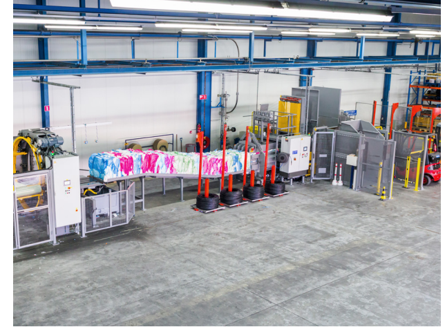
Fully-automated pressing and wrapping system