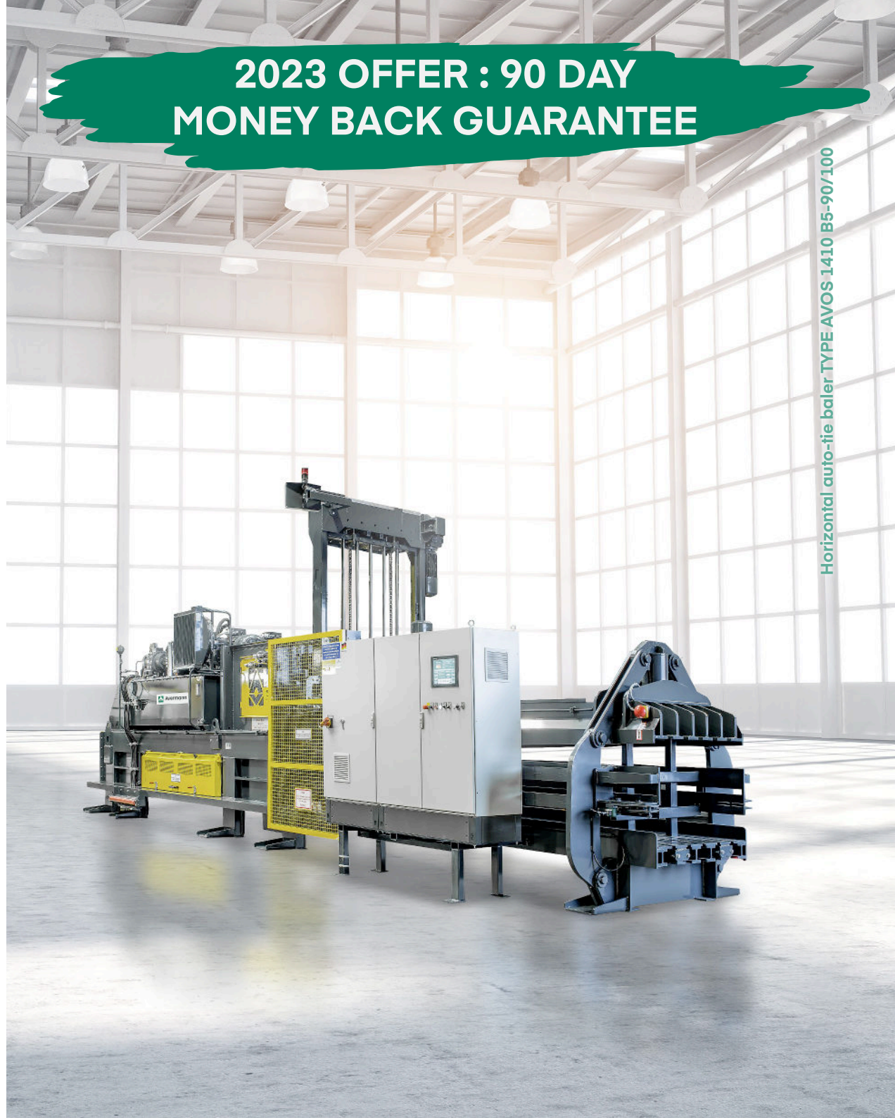
Horizontal auto-tie baler TYPE AVOS 1410 B5-90/100

2023 OFFER : 90 DAY MONEY BACK GUARANTEE