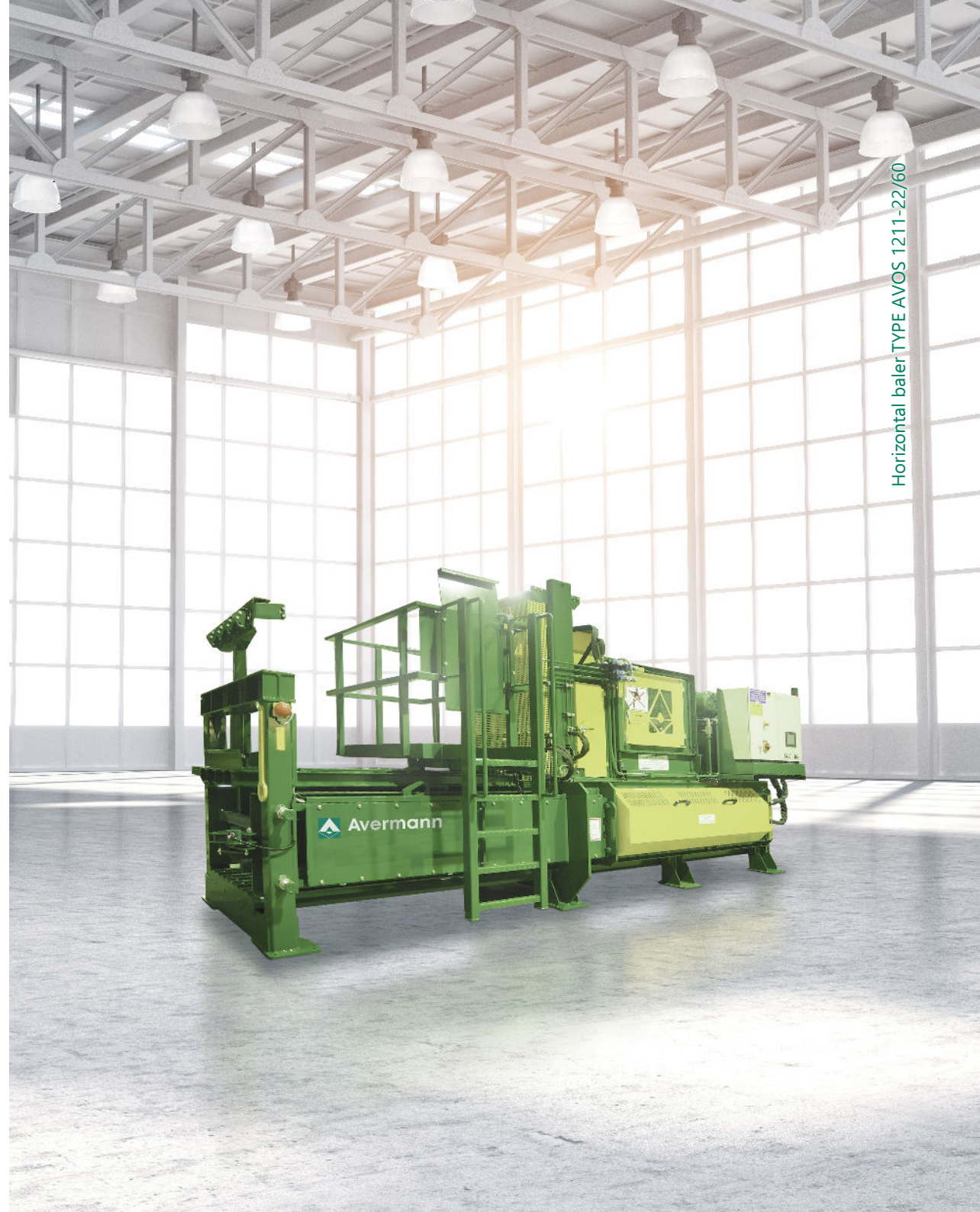
Horizontal baler TYPE AVOS 1211-22/60

sebweb@sebrightproducts.com . www.sebrightproducts.com