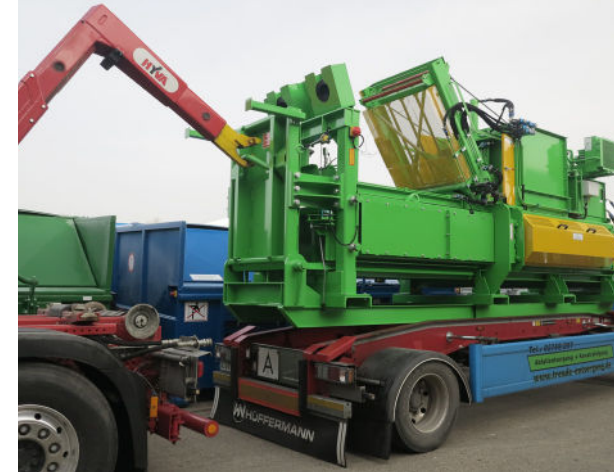
AVOS 1211 with hook base frame