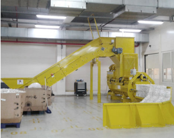
Version with sliding belt conveyor