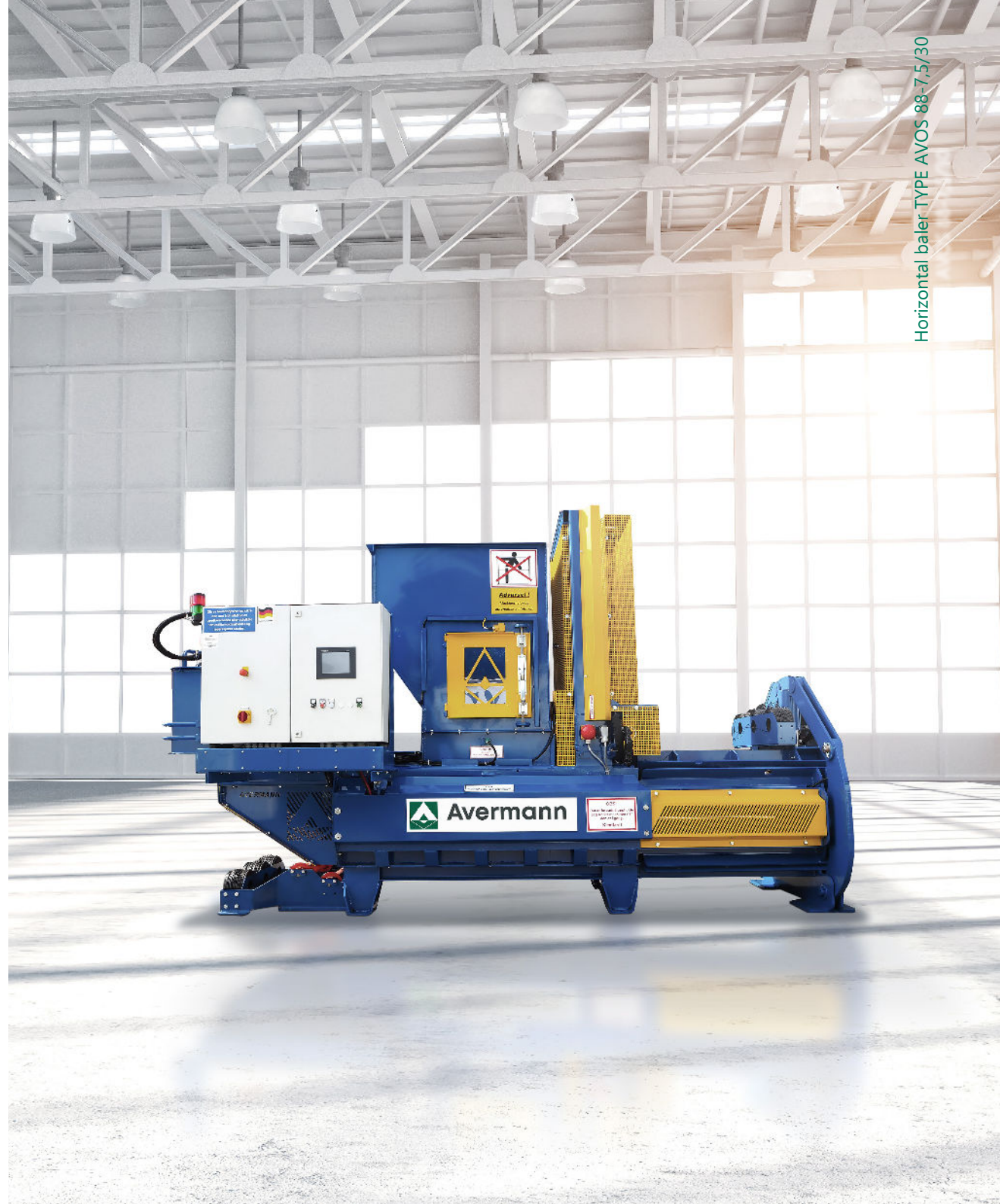
Horizontal baler TYPE AVOS 88-7,5/30

Phone +1-269-793-7183 . Fax +1-269-793-4022 sebweb@sebrightproducts.com . www.sebrightproducts.com